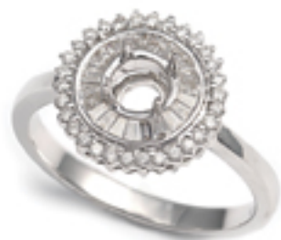
G-SRR4403-30 30RBC = 0.14ct 23TBGT = 0.19ct