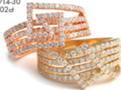
G-SGR1913-30 134 = 1.13ct