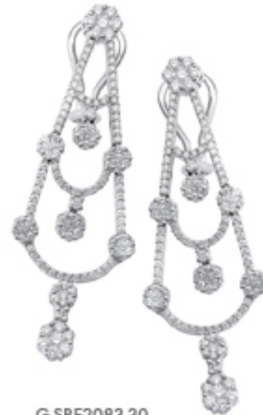
G-SRE2083-30 266 = 2.99ct