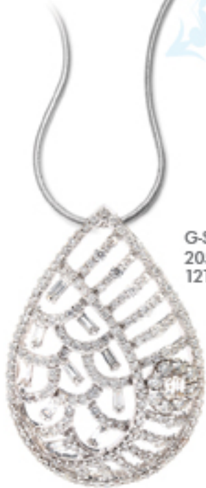
G-SRP2403-30 205RBC = 1.25 ct 12TBGT = 0.26ct