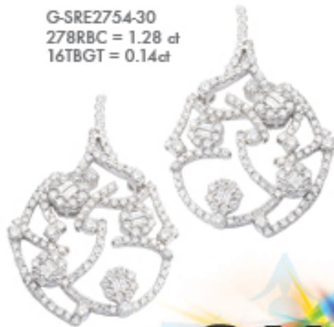
G-SRE2754-30 278RBC = 1.28 ct 16TBGT = 0.14ct