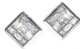
G-SRE2524-30 8TBGT = 0.24ct 10PR = 0.33ct