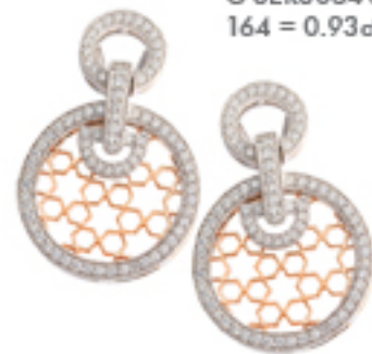
G-SER3064-30 164 = 0.93ct