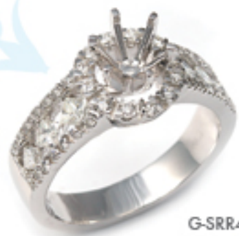
G-SRR4235-30 40 = 0.37ct 6PR = 0.42ct