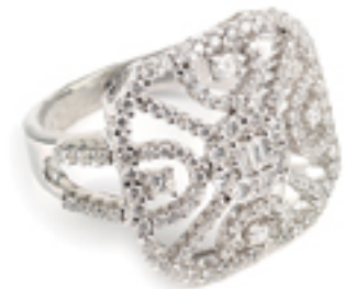
G-SRR4202-30 124RBC = 1.06ct 2TBGT = 0.05ct 4PR = 0.12ct