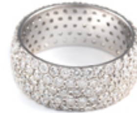
G-SRR4974-30 170 = 3.92ct