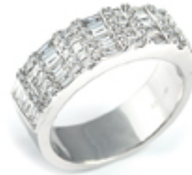
G-SRR4673-30ct 40RBC = 0.19ct 20TBGT = 0.59ct 20PR = 0.23ct