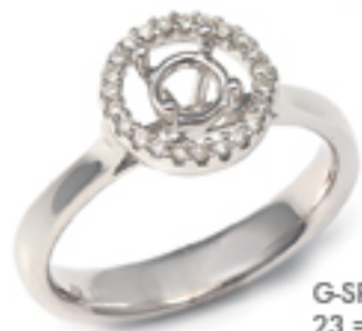
G-SRR5453-30 23 = 0.11ct