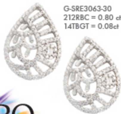
G-SRE3063-30 212RBC = 0.80 ct 14TBGT = 0.08ct