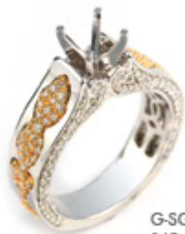
G-SGR2271-30 162 = 0.88ct