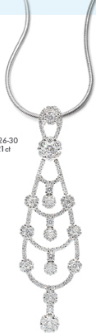
G-SRP3026-30 174 = 2.21ct