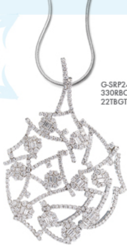
G-SRP2486-30 330RBC = 2.54 ct 22TBGT = 0.46ct