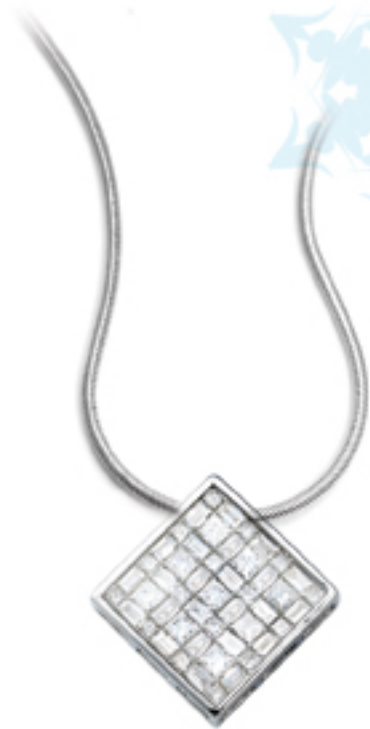
G-SRP2425-30 24TBGT = 0.83ct 25PR = 1.06ct