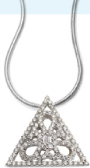
G-SRP2358-30 146RBC = 0.67ct 2TBGT = 0.05ct