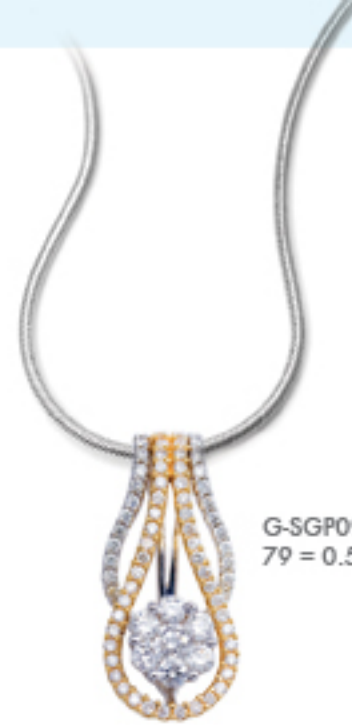
G-SGP0913-30 79 = 0.56ct